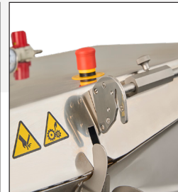
Knife to trim off the excess of casing.