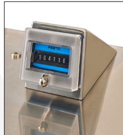
Counter of pieces.