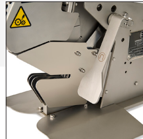
Lever for the automatic closure of the product.