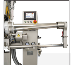
Movable stuffing tube to reduce the casing breakages and to center the clip.