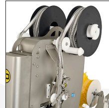
Clip on spool accessory for a faster production.