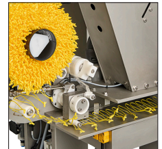
Automatic loop device.