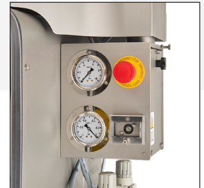
Adjustable vacuum time.